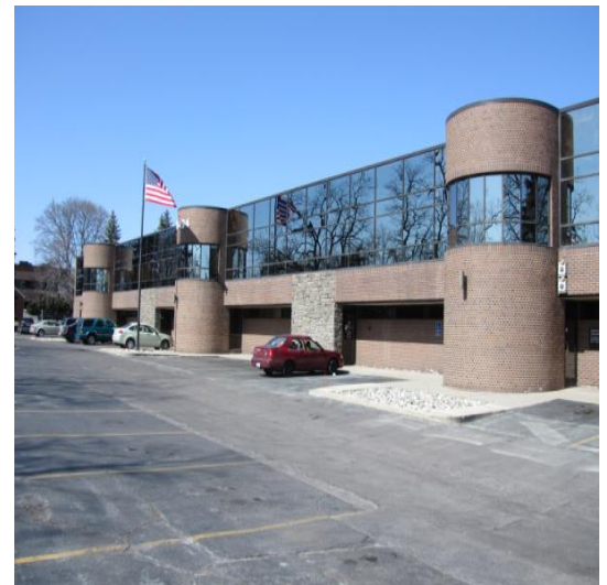
Front of building

Please park in the back of the building, enter through the two glass doors and take the stairs or elevator to the second floor. Turn left at top of stairs; we are in Suite 208.